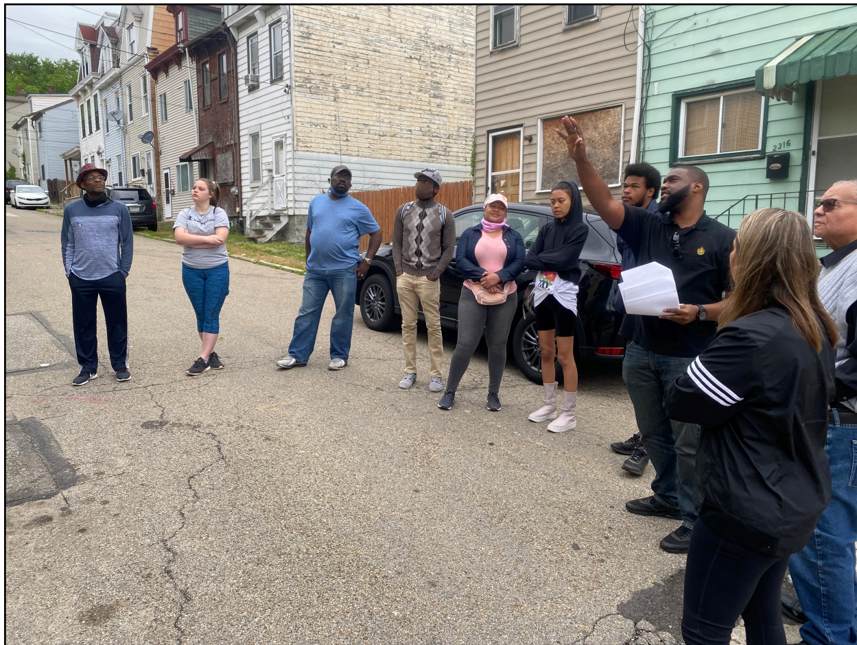
LMSDI Community Reinvestment Team on location in Marshall-Shadeland, May 2020.